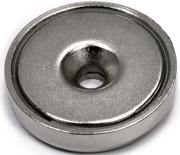
N52 Grade Neodymium Magnet